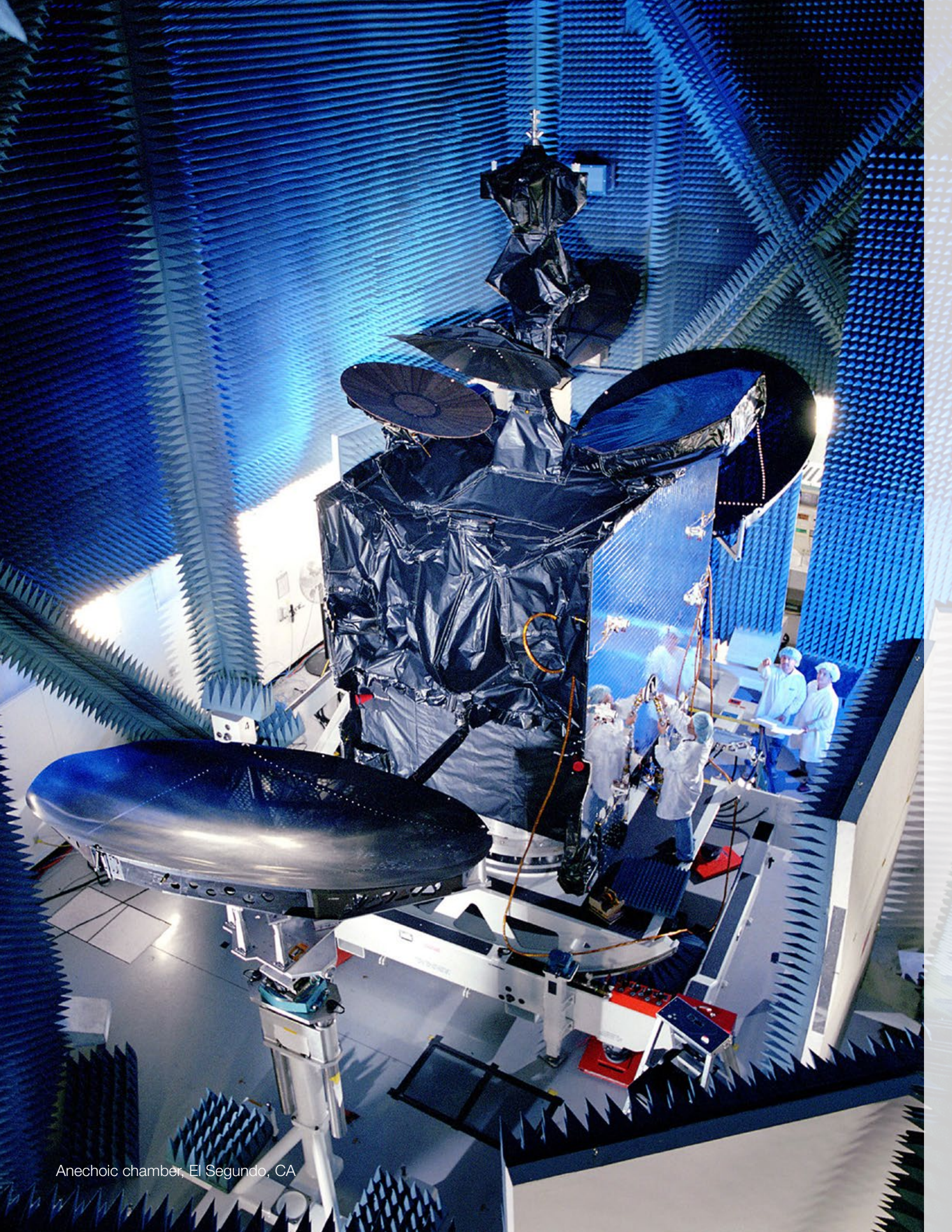
Anechoic chamber, El Segundo, CA