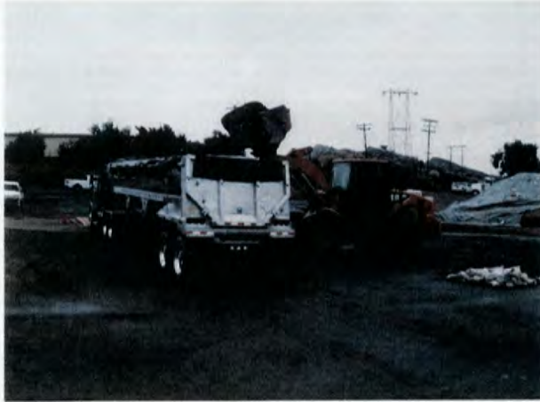
Loading non-hazardous soil into haul truck for transportation to an offsite disposal facility.