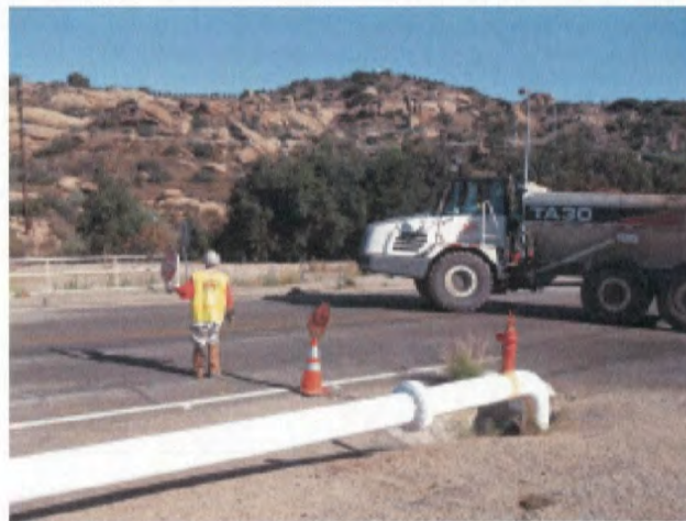
Flagman utilized to allow haul truck to safely move between the excavation site and the temporary stockpile area.