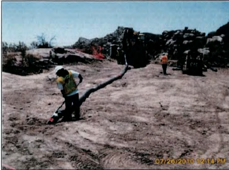
Using Vacuum truck to remove thin soils