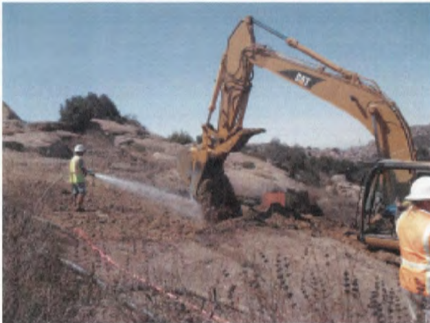
Excavating non-hazardous soil at B1-1B.