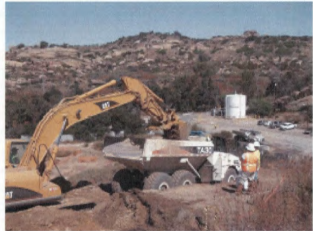
Loading non-hazardous soil from B1-1B into onsite haul truck for transportation to the temporary stockpile area.