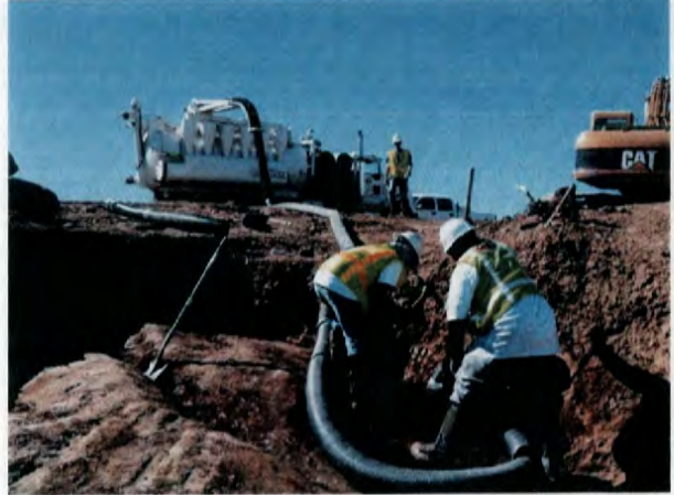
Excavating soil down to bedrock at CTLI-1A using a supervac.