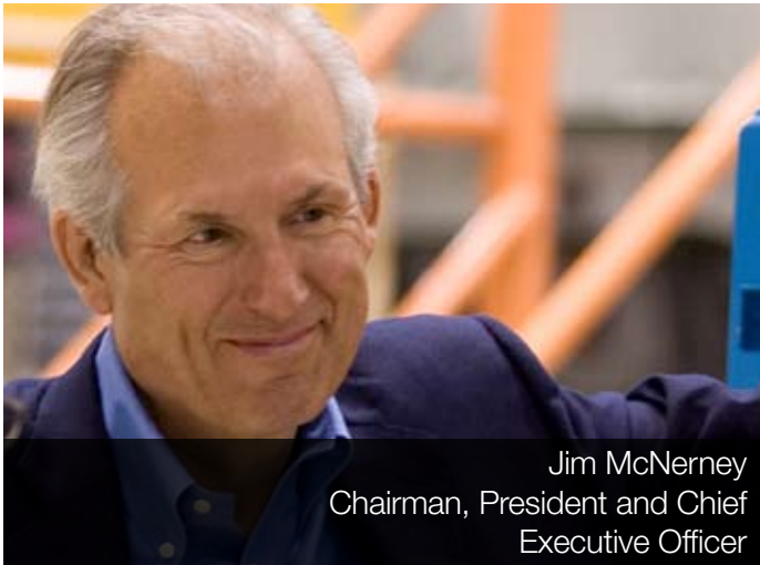
Jim McNerney Chairman, President and Chief Executive Officer

“Protecting our planet’s environment and finding new ways to harness diverse energy resources continues to be a priority for Boeing. And we are demonstrating our commitment through action.