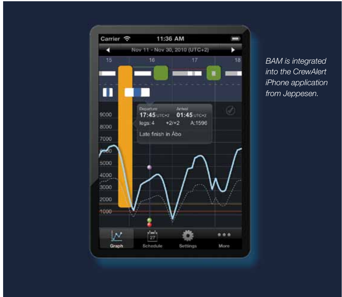
BAM is integrated into the CrewAlert iPhone application from Jeppesen.

Crew management is a complex process—often automated with optimization software. BAM was built with optimization in mind and is particularly well suited for constructing crew schedules in large calculation jobs. From construction of pairings, rosters—and ultimately from manpower planning to day-of-ops—BAM is fully compliant with Jeppesen's Common Alertness Prediction Interface (CAPI), ensuring seamless integration with the Jeppesen crew management products.