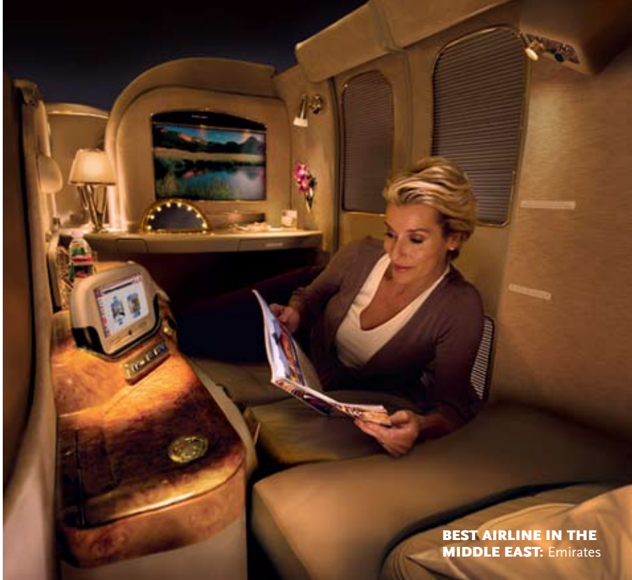
BEST AIRLINE IN THE MIDDLE EAST: Emirates