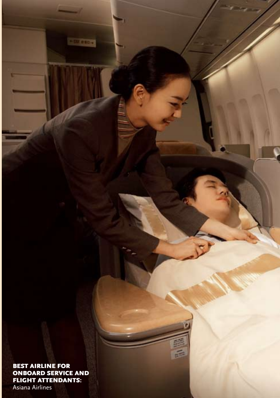
BEST AIRLINE FOR ONBOARD SERVICE AND FLIGHT ATTENDANTS: Asiana Airlines

Airline in Southeast Asia. For the second year in a row, readers named Jet Airways the Best Airline in Central/South Asia and India. Having just entered the U.S. market in 2008 with service from Seattle, Hainan Airlines has already made a positive impression on GT readers, who voted the carrier Best Airline in China. Making a leap from a sixth-place finish in 2007, Korean Air earned readers' vote for Best Airline in North Asia.