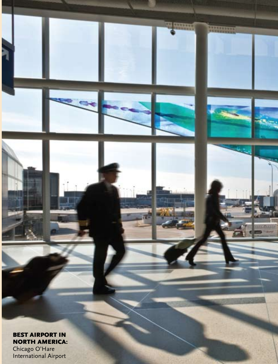
BEST AIRPORT IN NORTH AMERICA: Chicago O'Hare International Airport

experience. “We remain committed to providing a world-class customer service experience to our valued Crown Room Club members, including premium products such as WiFi and complimentary cocktails, when they visit any one of our more than 35 Clubs worldwide.”