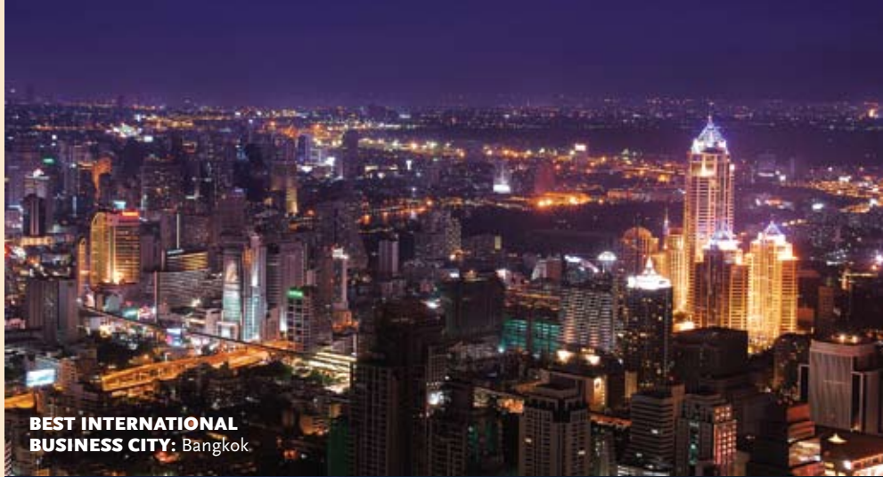
BEST INTERNATIONAL BUSINESS CITY: Bangkok