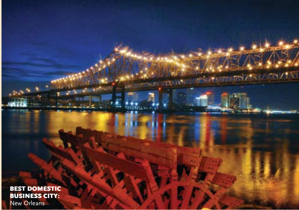
BEST DOMESTIC BUSINESS CITY: New Orleans