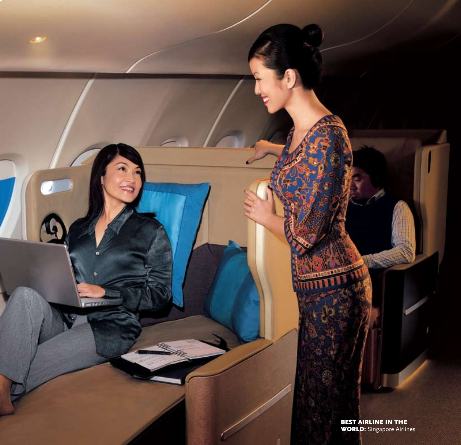
BEST AIRLINE IN THE WORLD: Singapore Airlines

can Airlines is, for the third consecutive year, the Best Airline for Domestic First Class.