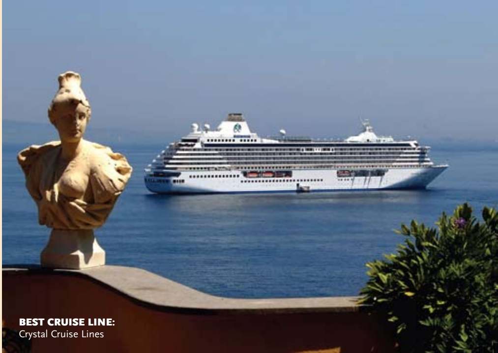
BEST CRUISE LINE: Crystal Cruise Lines