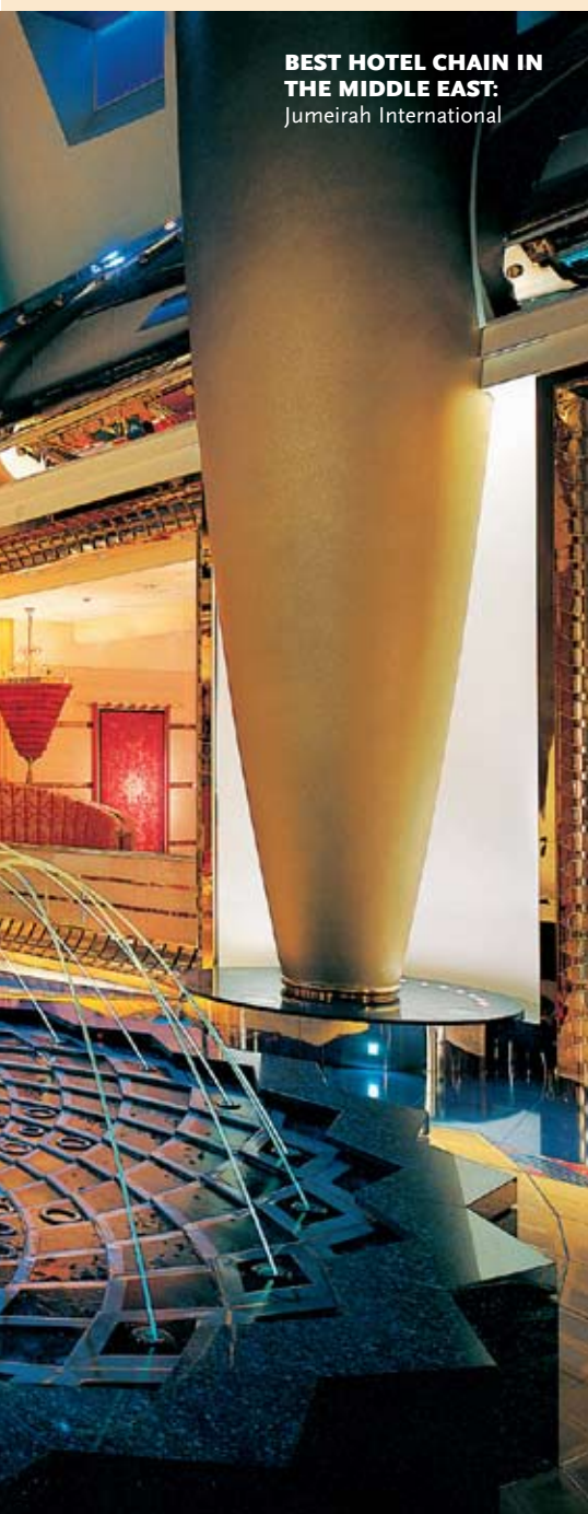
BEST HOTEL CHAIN IN THE MIDDLE EAST: Jumeirah International