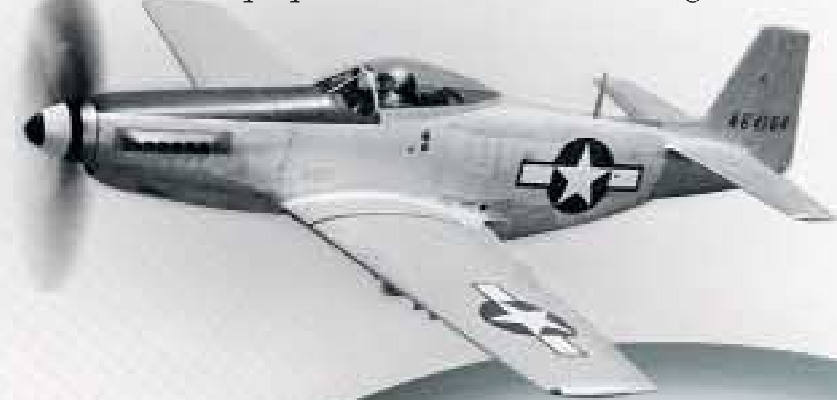
An airplane may be powered by a single propeller, as on the P-51 Mustang, or several.

There are four main types of systems for producing thrust in modern aircraft: propellers, jet turbine engines, ramjet engines, and rocket engines. Each produces thrust in a different way.