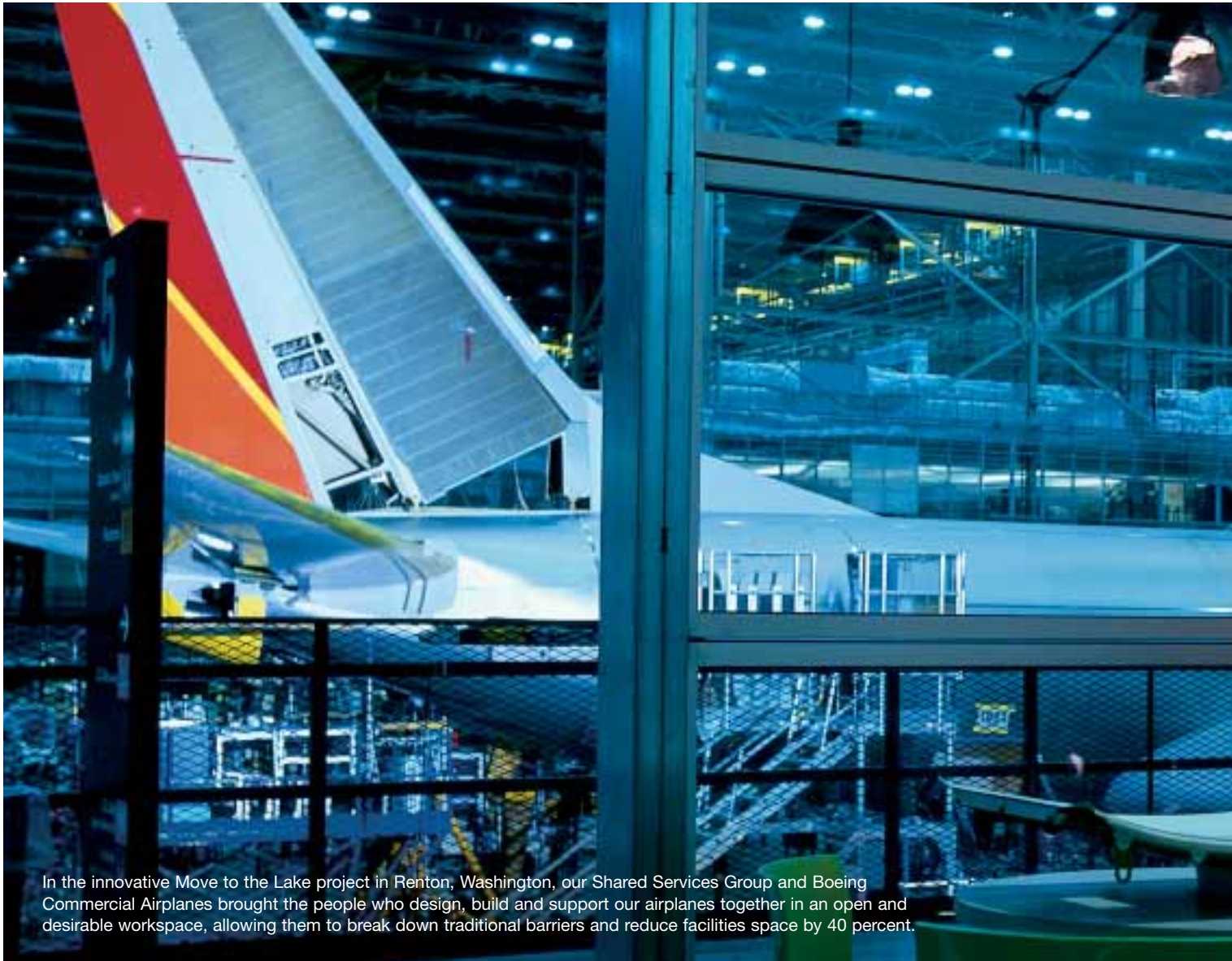
In the innovative Move to the Lake project in Renton, Washington, our Shared Services Group and Boeing Commercial Airplanes brought the people who design, build and support our airplanes together in an open and desirable workspace, allowing them to break down traditional barriers and reduce facilities space by 40 percent.

We integrate services across the enterprise to help our businesses operate more effectively and efficiently. Our real property management program and virtual office initiatives have reduced the footprint of Boeing by more than 6.8 million square feet over the past two years. Since 1997, while computing network traffic increased 1,900 percent, we reduced computing infrastructure costs 47 percent and, since 2001, lowered the number of Boeing computing systems