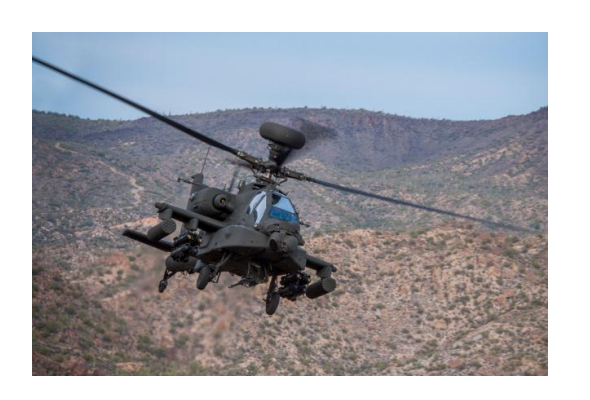
AH-64E Apache Helicopter

*Includes new, remanufactured and renewed aircraft