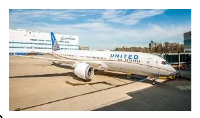
First BSC 787-9 delivery

Focusing on execution, quality and productivity