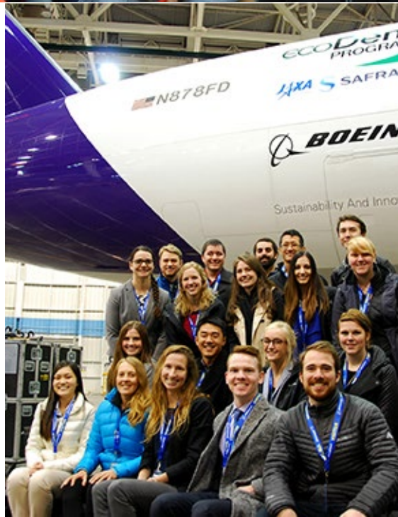
Right: Puget Sound-area students tour the 2018 ecoDemonstrator, a 777 Freighter on loan from Boeing customer FedEx. The ecoDemonstrator program, now in its fifth iteration, serves as a series of flying test beds designed to improve the environmental performance of future airplanes.