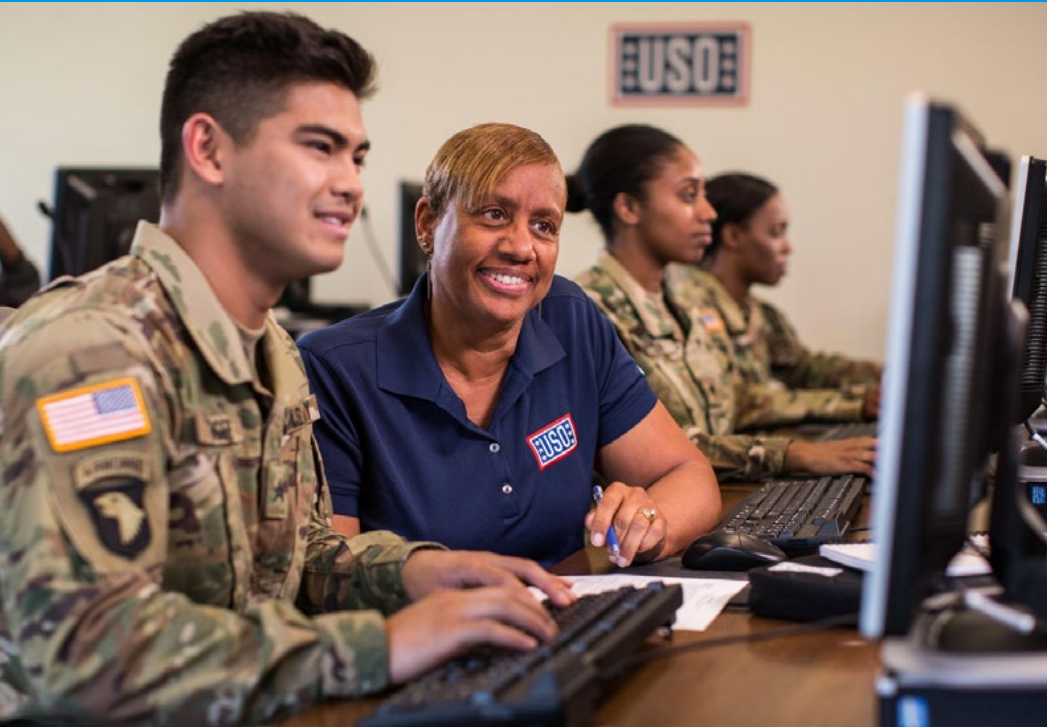
Above: A United Service Organizations (USO) employee works with a transitioning service member as part of USO's Pathfinder program. Boeing is a premier partner of USO Pathfinder — the nation's first comprehensive employment readiness program for transitioning military service members.