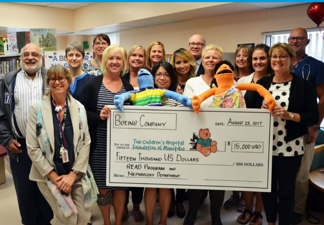
Above: Boeing Canada Winnipeg employees present the Children's Hospital Foundation of Manitoba with a check for $15,000. In recognition of the site's victory in the annual Boeing on the Move wellness competition, Boeing provided a donation to the site's charity of choice.