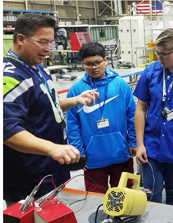
Right: Students from Mariner High School in Everett, Washington, hear Boeing employees explain how to remove the outer layer of plastic surrounding electrical wires prior to soldering the wires together as part of Manufacturing Day events at the site.

"Our mission at FAME is to prepare and motivate students, with a specific focus on under-represented minorities and girls, to enter college and complete a degree and seek a career in STEM. ... Our partnership with Boeing is a perfect fit! Our enrichment initiatives motivate students to pursue and succeed in the fields of science, technology, engineering and math. Thanks to The Boeing Company, we can continue to build upon our success."