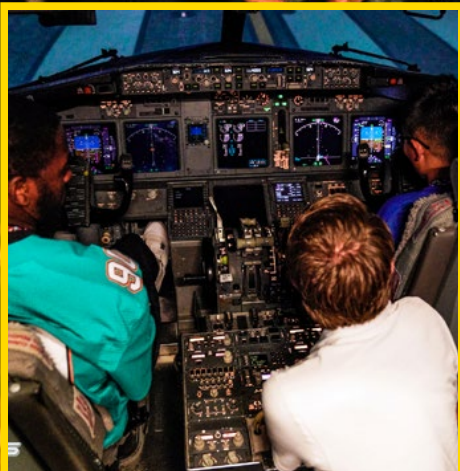
Above: Miami Dolphins players and students from Hialeah Gardens Middle School learn the fundamentals of flight in a simulator at Boeing's Training & Flight Services facility in Miami, Florida.