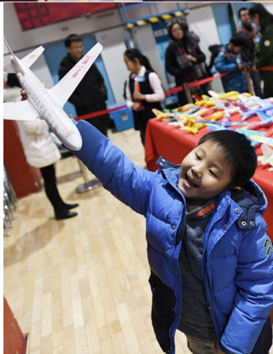
Right: A young innovator participates in the annual Boeing China Youth Airshow and Creative Flight Carnival in Beijing, China. The annual event, part of the Boeing-sponsored “Soaring with Your Dream” program, helps drive science, technology, engineering and math (STEM) interest in the country.