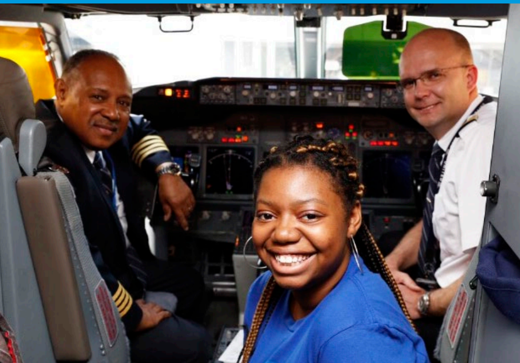
Above: A Chicago Public School (CPS) student poses with United Airlines pilots prior to departure. More than 50 CPS students participated in the joint Boeing- and United-sponsored Chicago Goes Global youth immersion and development program in which students learn about history, culture, education, business and politics through hands-on activities and meetings with community leaders.