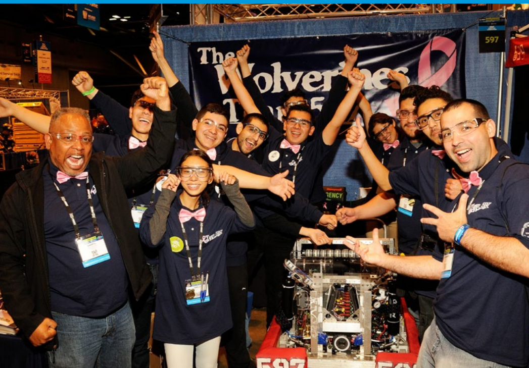
Above: Boeing-sponsored FIRST Robotics team 597, “The Wolverines,” gathers for a photo in the team’s work pit. The South Los Angeles team is a past recipient of the FIRST Chairman’s Award. The most prestigious award at FIRST, it honors the team that best represents the purpose, goals and mission of the organization.