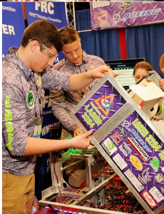
Right: Boeing-sponsored FIRST Robotics team 3204, “Laser,” makes final preparations to the team’s robot before the 2017 championship round.

More than 400 Boeing employees and retirees mentored 550 teams in the 2018 season