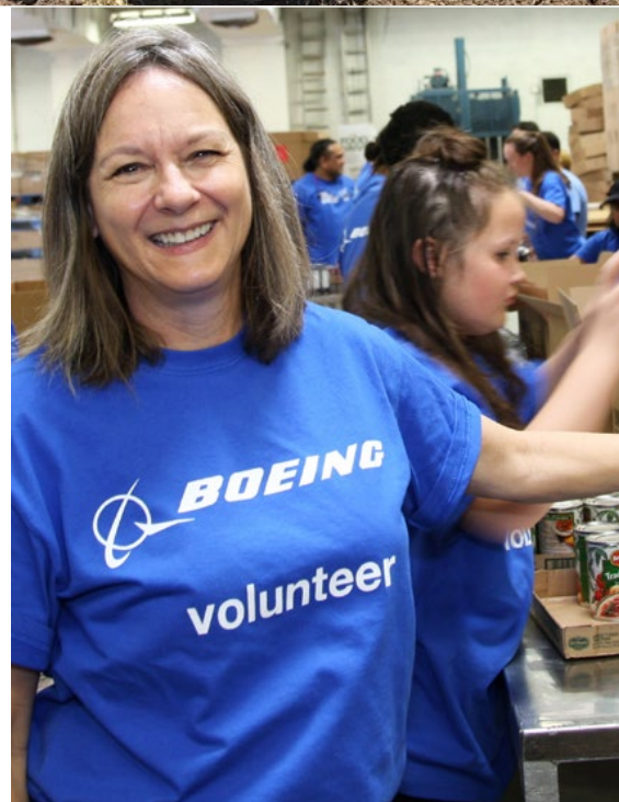
Right: Boeing employees package food donations collected during Boeing's 2017 Food & Essentials drive.

"The National Forest Foundation is proud to announce our partnership with The Boeing Company. ... This work is improving a critical watershed and reconnecting habitat[s] for native fish. Boeing's support will help us complete a critical phase of a multi-year scope of work. We are grateful for [their] generous support."