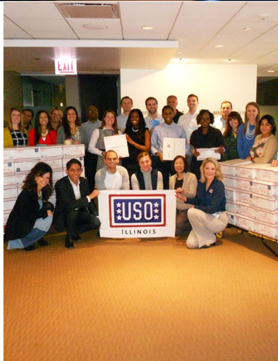
Right: Boeing Chicago employees gather to assemble care packages for troops serving overseas. In partnership with the USO of Illinois, the annual event provides seasonal items to help troops celebrate the holidays.

"Support from the USO doesn't stop when service members leave the military. We are proud to once again partner with Boeing to provide best-in-class transition services to service members and their families. ... [Boeing's] continued support will help the USO offer the highest quality of transition services to meet the broadest spectrum of needs."