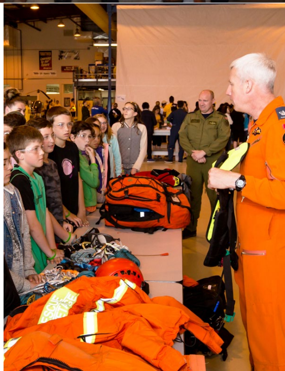
Right: More than 700 6th grade students participated in the Aerospace and Aviation in Manitoba (AAiM) Day activities at the Red River College Stevenson Campus in Winnipeg, Manitoba. AAiM Day is part of a larger portfolio of education programming that reinforces the province's thriving aviation and aerospace industry.

"[Boeing's] donation will go a long way in support of the READ Program and Nephrology Department and will make a difference in the lives of children by funding specialized patient programs at the Children's Hospital. We continue to reach these goals through the support of people in the community like you. ... For every child who is currently using the hospital, I want to offer you my deepest thanks for your support. Together, we truly can make miracles happen."