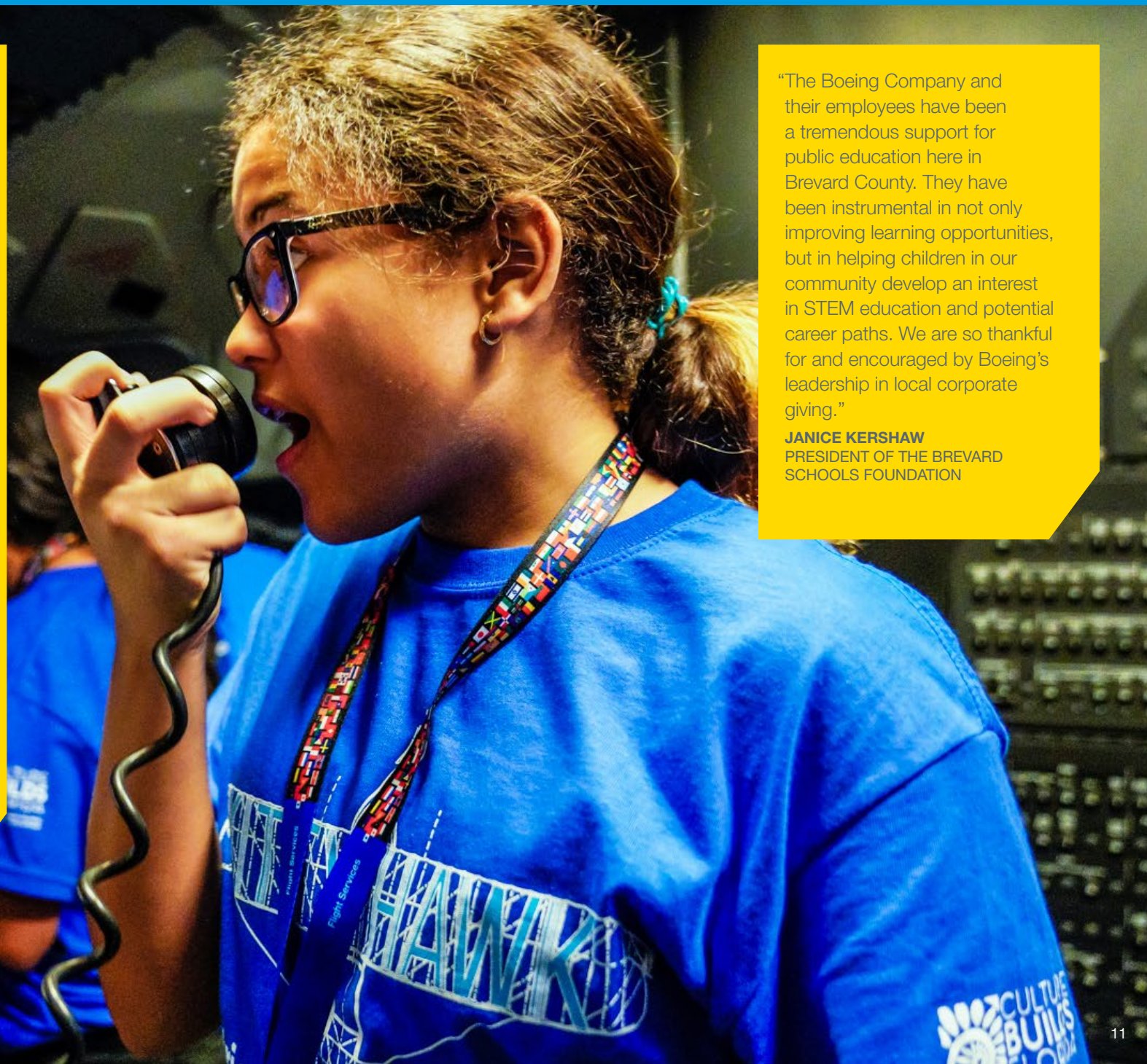
Right: A local student radios the call tower in a Boeing simulator during the Boeing-hosted Science, Technology, Engineering and Mathematics (STEM) Experience Day. The event works to develop tomorrow's innovators through investments in experiential learning and by generating interest and sustained participation in STEM in the Miami community.

"The Boeing Company and their employees have been a tremendous support for public education here in Brevard County. They have been instrumental in not only improving learning opportunities, but in helping children in our community develop an interest in STEM education and potential career paths. We are so thankful for and encouraged by Boeing's leadership in local corporate giving."