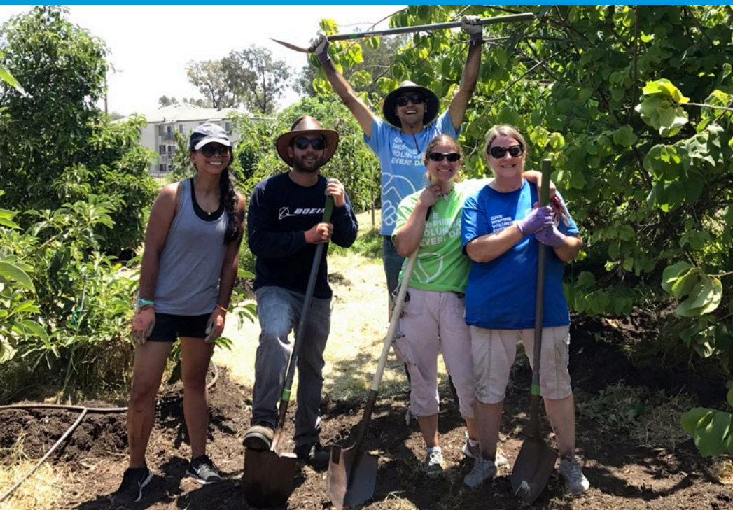
Above: Boeing employee volunteers lend a hand at Growing Experience Urban Farm in Southern California. Volunteers prune palm trees, clean up the native plant garden, remove dead and invasive plant species and compost around the one-acre food forest orchard.