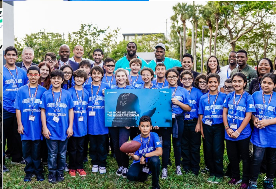
Below: Miami Dolphins players participate in Boeing's Science, Technology, Engineering and Mathematics (STEM) Experience Day for local middle school students at Boeing's Miami campus.