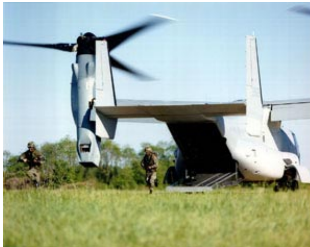
Mission-oriented evaluations go further during Operational Evaluations than during Operational Testing (OT-IID). Op-eval continues until May 2000.

Early next year, the MOTT will conduct survivability tests on the range at China Lake and continue with additional shipboard testing. Other tests will include fast roping, hoist operations, and flying multi-aircraft forma-