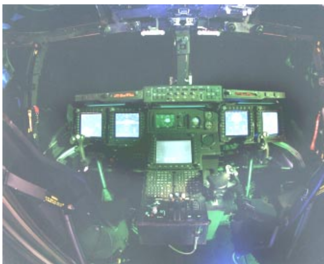
The V-22 cockpit has been modified to receive flat panel multi-function display technology, saving $500 million in procurement costs.