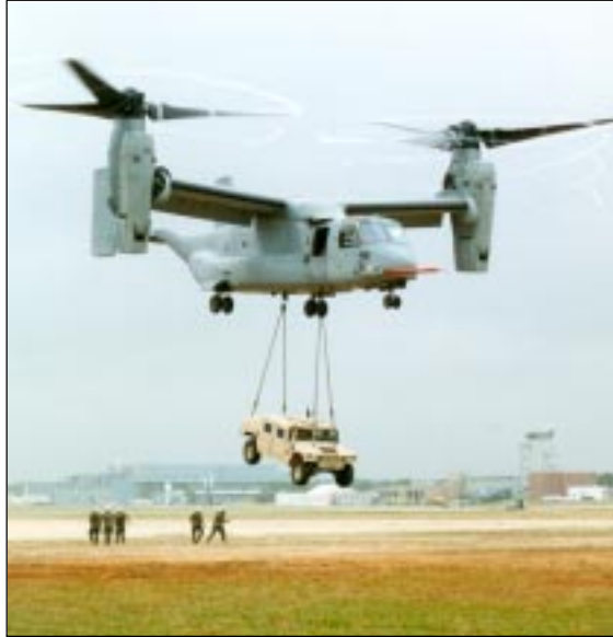
The Army's Highly Mobile Multi-wheeled Vehicle (Humvee) was carried during external loads testing in 1999.

of a helicopter with the long range, high speed and endurance of an airplane. This versatility is achieved by placing oversized propellers (prop-rotors) and their engines at the tips of wings, which enables the propellers to pivot from vertical to horizontal position while in