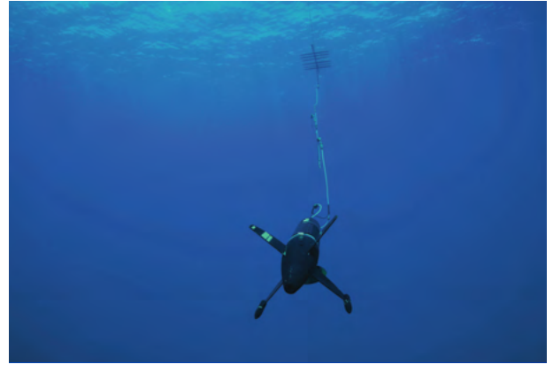
Massive Towing Capability - Tow cable assembly attached to Wave Glider sub