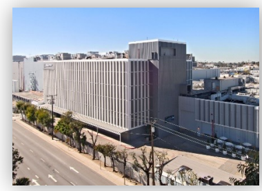
Exterior of Boeing Satellite Factory

Boeing's satellite systems business is located in El Segundo, Calif. The world's first geosynchronous communications satellite, Syncom, was built there by Boeing and launched in 1963. Since then, Boeing has delivered more than 300 satellites to more than 50 customers in more than 20 countries, and continues to design and build government and commercial satellites in its factory in El Segundo.