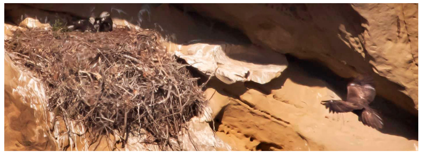
Golden eagle nest at Santa Susana with mom, dad and two eaglets.

Golden eagles have been spotted flying in and around the Santa Susana Field Laboratory for decades. The expansive areas of rocky bluffs and large former tests stands provide the perfect nesting habitat for golden eagles and other raptors. In 2011, Boeing's biologists documented an active golden eagle nest at the site for the first time. Over the next decade, biologists monitored that eagle nest and observed no inhabitants. This summer, biologists