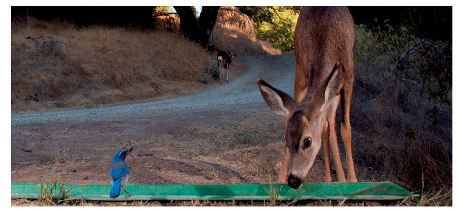
Boeing receives gold-level environmental certification from the Wildlife Habitat Council.

Boeing's commitment to environmental stewardship at Santa Susana was recognized recently by the Wildlife Habitat Council (WHC) with a goldlevel environmental conservation recertification. The site was originally certified in 2014 and received the gold-level certification, the highest level WHC bestows, in 2018. Santa Susana's recertification acknowledges the importance of biodiversity restoration at the site, including establishing pollinator habitats, utilizing citizen scientists for biological and wildlife studies, offering community outreach activities and ensuring contractors receive rare and protected plant species briefings. WHC also recognized Boeing with an award for remediation work at the site, which includes proficiency in stormwater management, groundwater investigation and treatability studies and interim soil excavation activities.