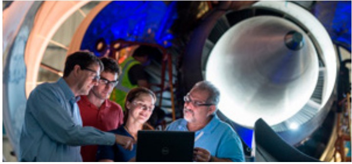
Boeing's inaugural Sustainability Report focuses on environmental stewardship, social progress and inclusion, and values-based and transparent governance.

To read the report, visit: https://www.boeing.com/principles/ sustainability/annual-report/index.page.