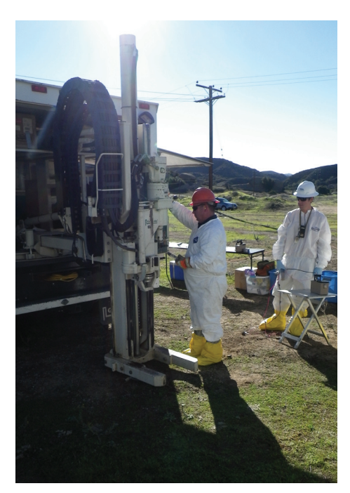
Figure 2: Workers conducting subsurface soil sampling in Area IV with a direct push drill rig

Throughout Area IV and the Northern Buffer Zone, a total of 3,735 surface and subsurface soil samples were collected and analyzed for radioactive contaminants. The analytical results were compared to the background levels in accordance with the AOC.